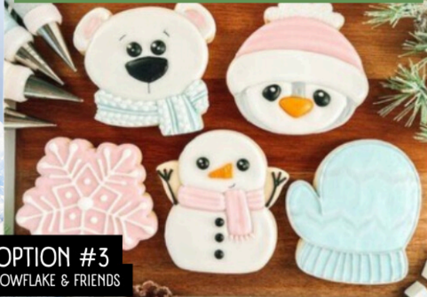
OPTION #3 SNOWFLAKE & FRIENDS

EACH KIT IS $30 & INCLUDES: 12 SUGAR COOKIES WITH 4 BAGS OF ICING!