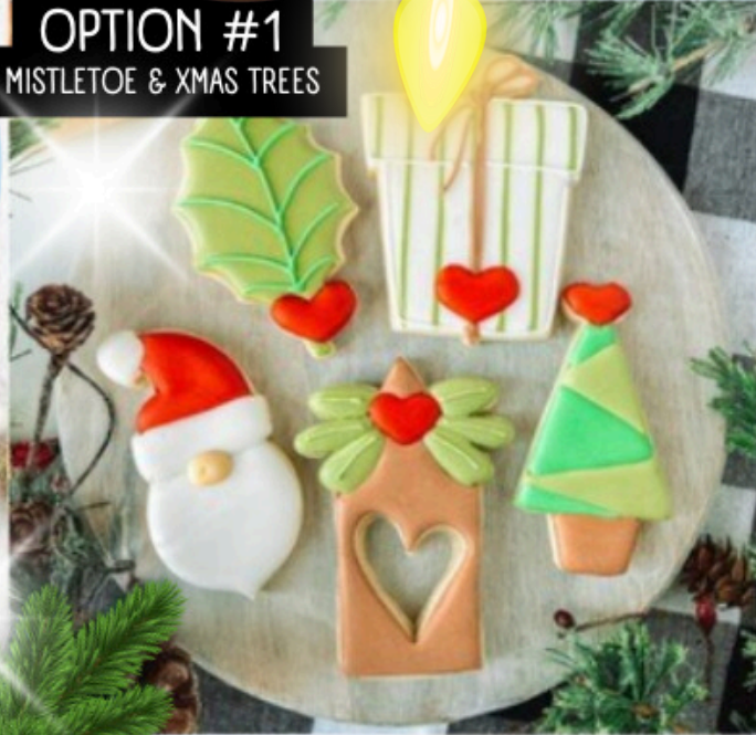
OPTION #1 MISTLETOE & XMAS TREES