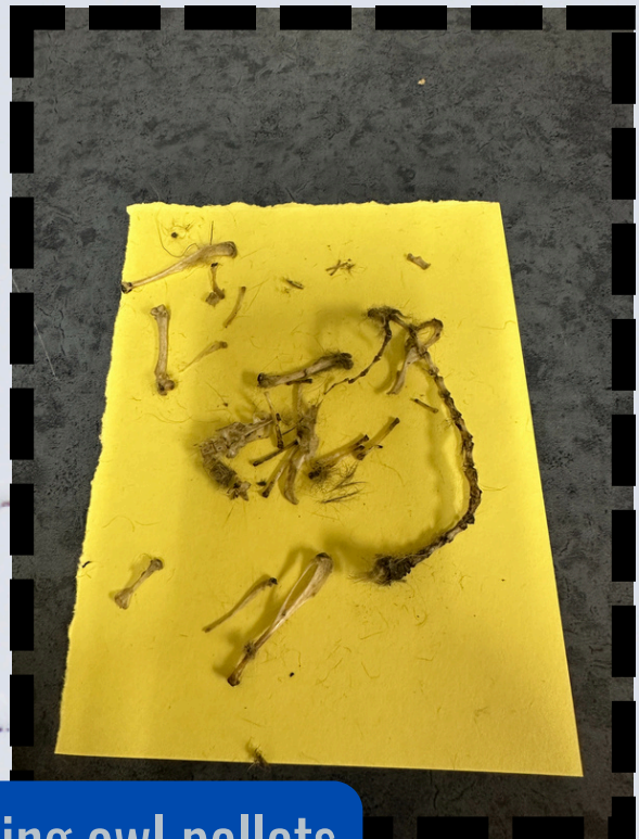
Class 7T dissecting owl pellets