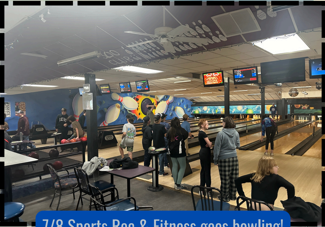
7/8 Sports Rec & Fitness goes bowling!